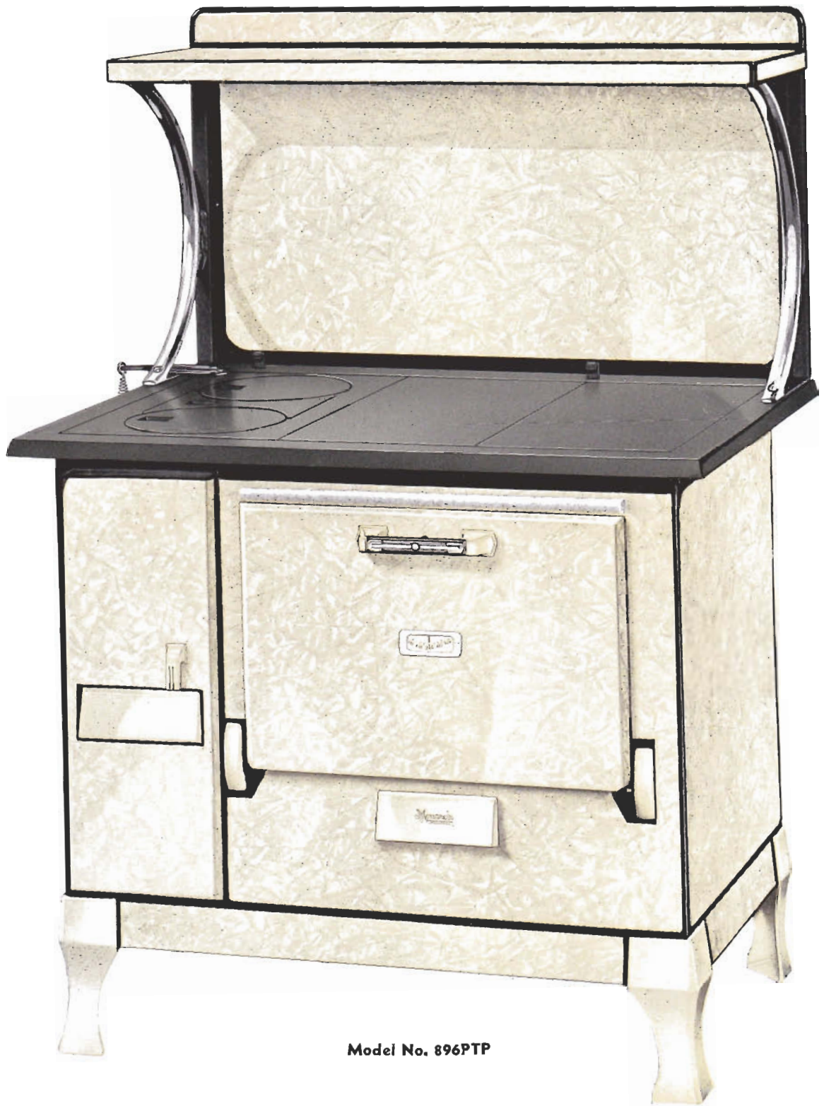
Model No. 896PTP