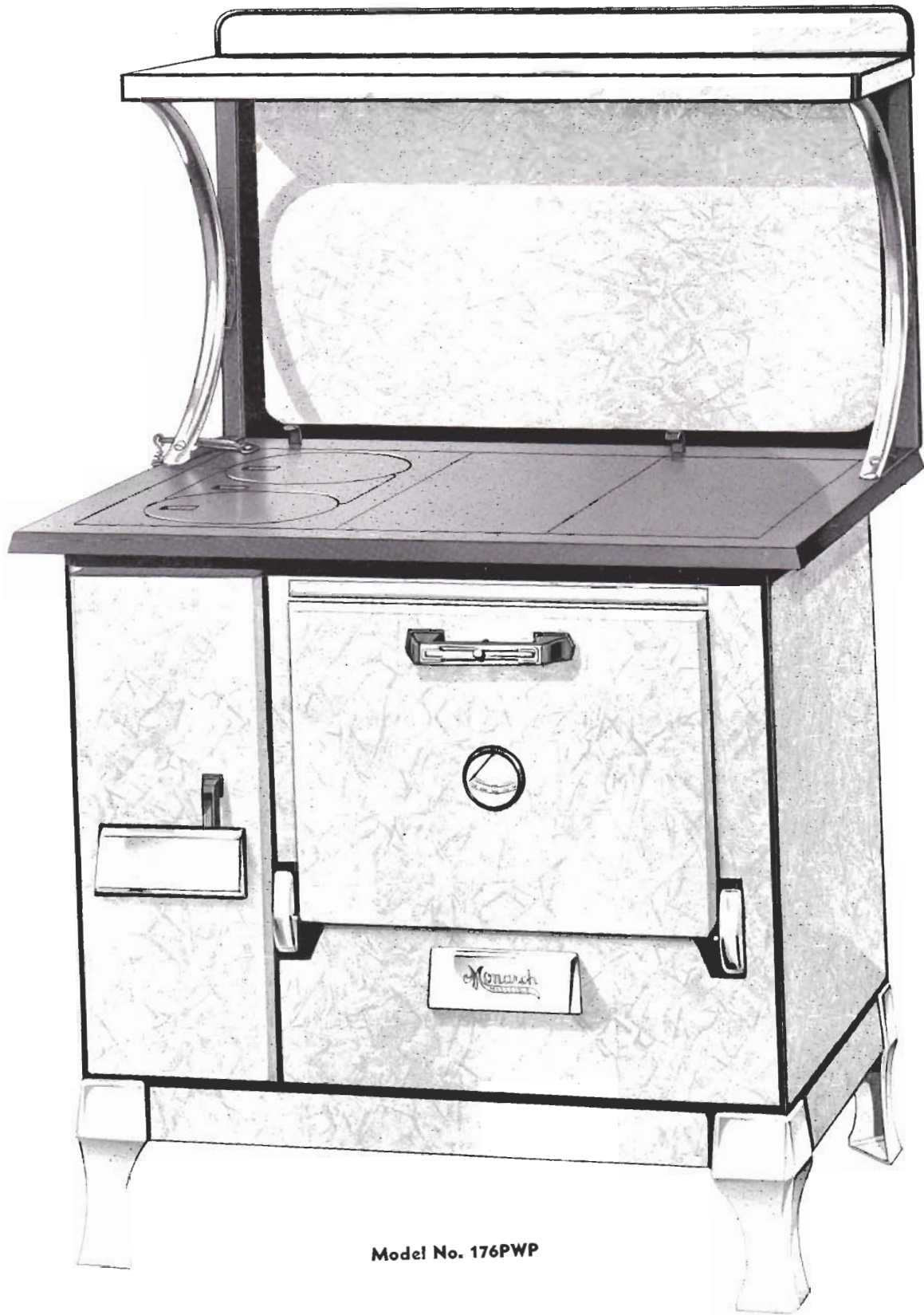
Model No. 176PWP